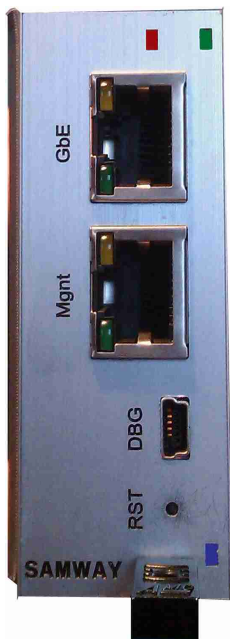
Fig 1: Front Panel

The Front Panel of the Samway-MCH is presented in Fig.1.